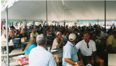
The CHVAC Group - Awesome!