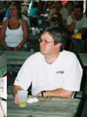
Chip's anticipating winning a big prize!