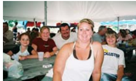
The West Family