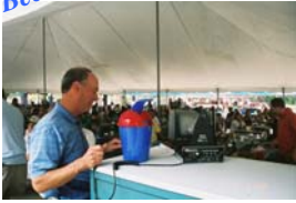
Why do we have to listen to him again?