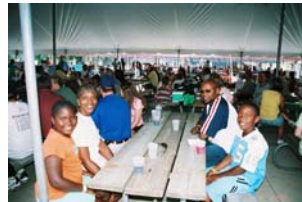
The Asberry Family