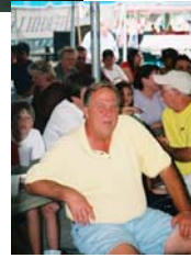
Mr. Calm, Cool and Collected