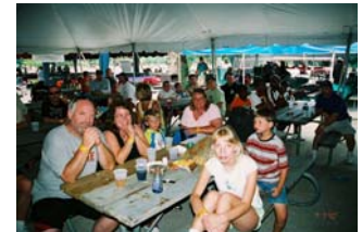
The Wietmarschen Family