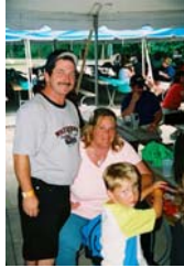
The Schutte Family