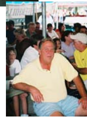
Mr. Calm, Cool and Collected