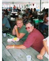
The Childress' had an Ohio pass for the day