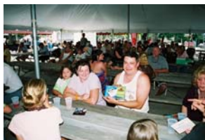
Another winner for the Wolf's