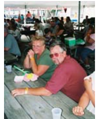
The Childress' had an Ohio pass for the day