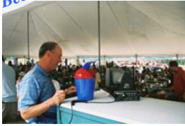
Why do we have to listen to him again?